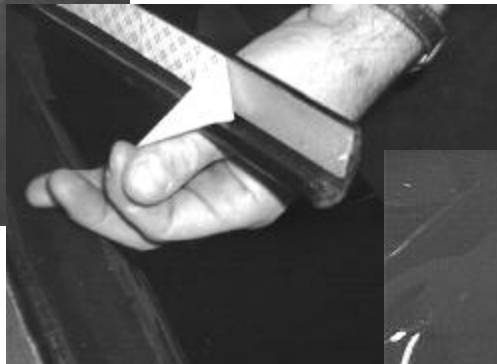
Step 2: Remove adhesive as you apply.