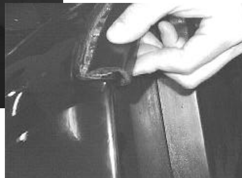
Step 3: Apply by pressing trim firmly against body.

Warranty: The normal warranty applies. Updated parts will