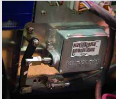
J&J exclusive Linear Actuator

Asmo 48vdc Permanent Magnet electric motor. 240 or 400 volt chargers available. Hour meter. Front and rear "Nerf Bars". Stock car replica graphics packages. Many more options available.