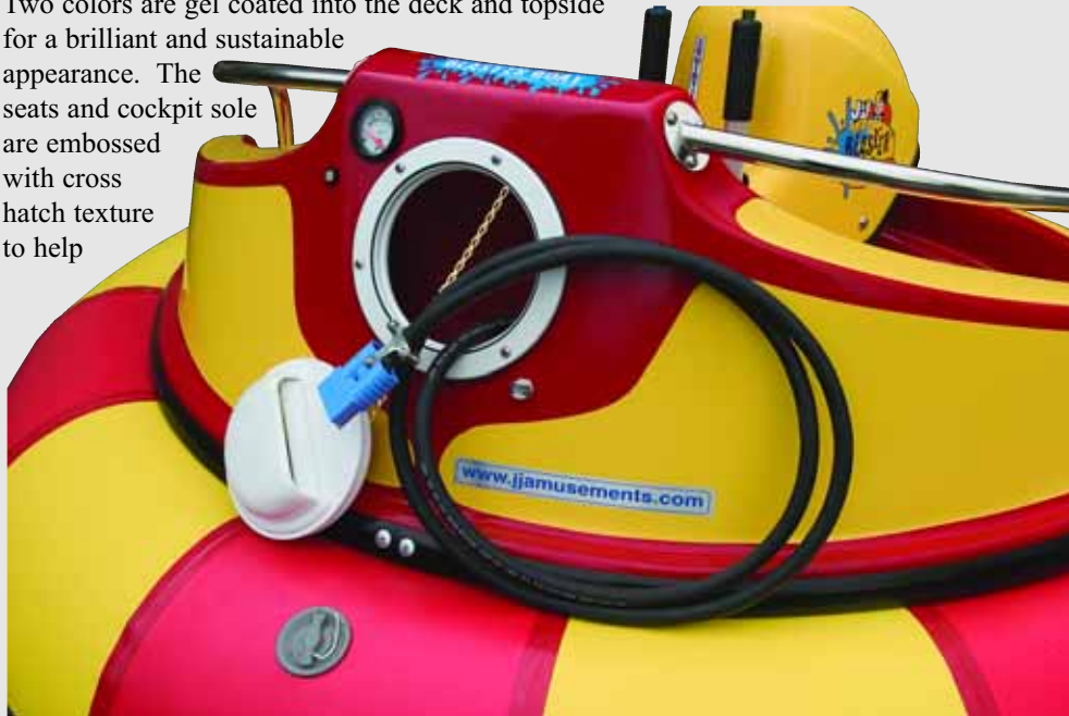
Charger access port on rear of boat hull

The Blaster Boat is designed for one adult and two small children, with a total passenger weight up to 275 lbs. The hull and deck are made of durable fiberglass reinforced plastic. Two colors are gel coated into the deck and topside for a brilliant and sustainable appearance. The seats and cockpit sole are embossed with cross hatch texture to help